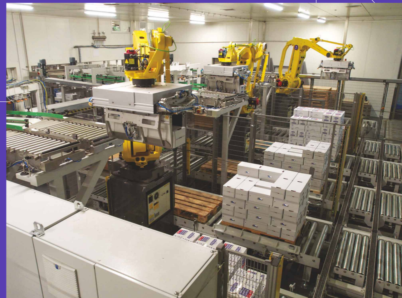
Robotic Palletizing Station for Butter